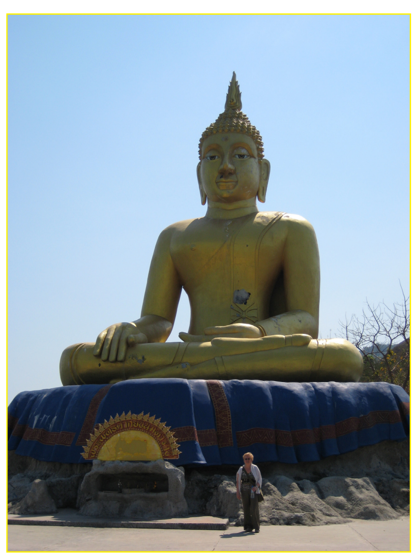
Fig. 8. Large Buddha statue at the 'Wat Tham Khao Tao' near the Khao Tao reservoir.

Some kilometres north of Pranburi near the Khao Tao reservoir is the 'Wat Tham Khao Tao', with at the summit of a hill a large Buddha statue (fig. 8)