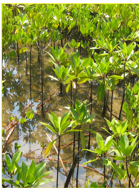
Fig. 4. Seedlings of a mangrove tree.