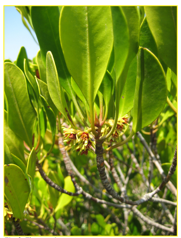
Fig. 3. Flowers of a mangrove tree.